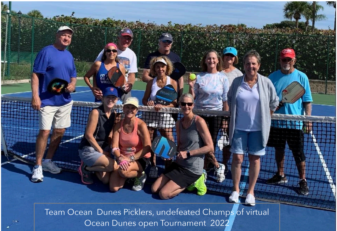
Team Ocean Dunes Picklers, undefeated Champs of virtual Ocean Dunes open Tournament 2022