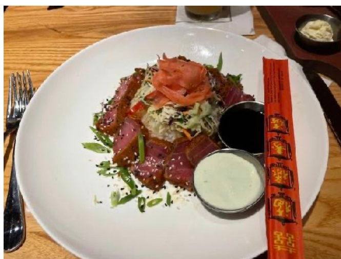
Blackened Aho Tuna over Citrus Rice with Asian Cole Slaw.