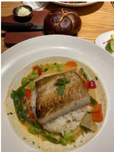
Pan Roasted Mahi Mahi over Ginger Rice