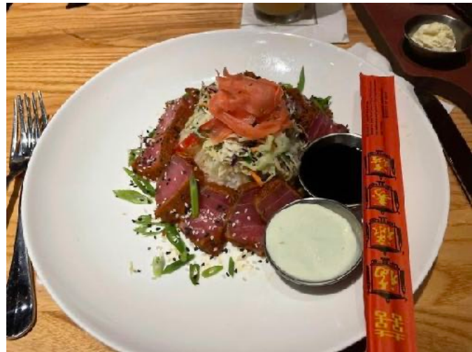
Blackened Aho Tuna over Citrus Rice with Asian Cole Slaw.