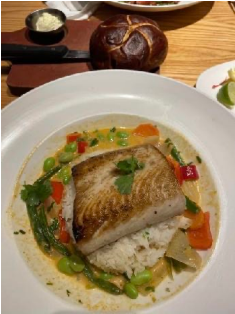
Pan Roasted Mahi Mahi over Ginger Rice