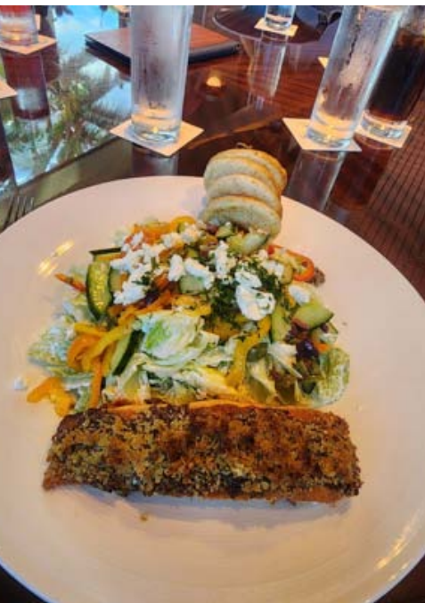
Pistachio Crusted Salmon