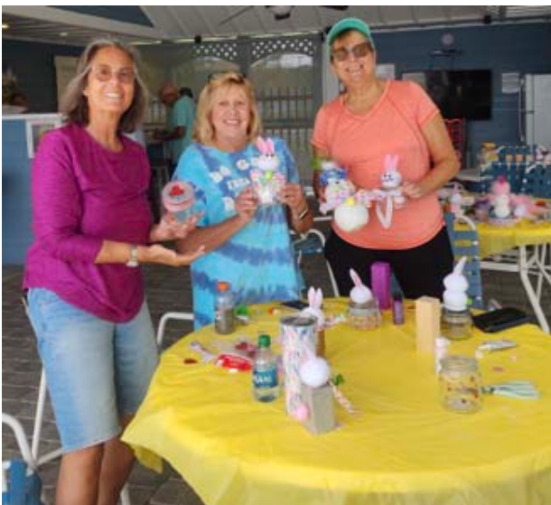
A fun morning!