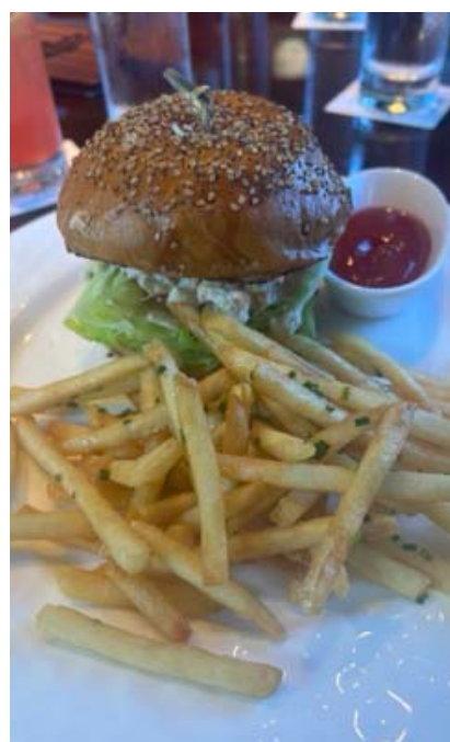
Seafood Salad Sandwich