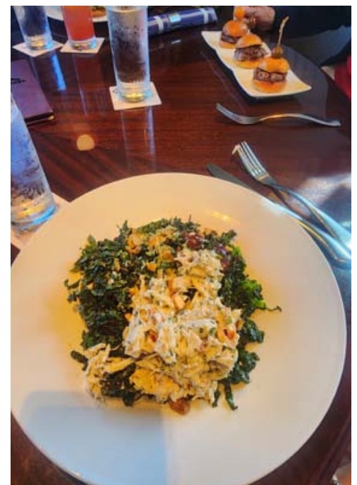
Kale Salad Filet Mignon Sliders