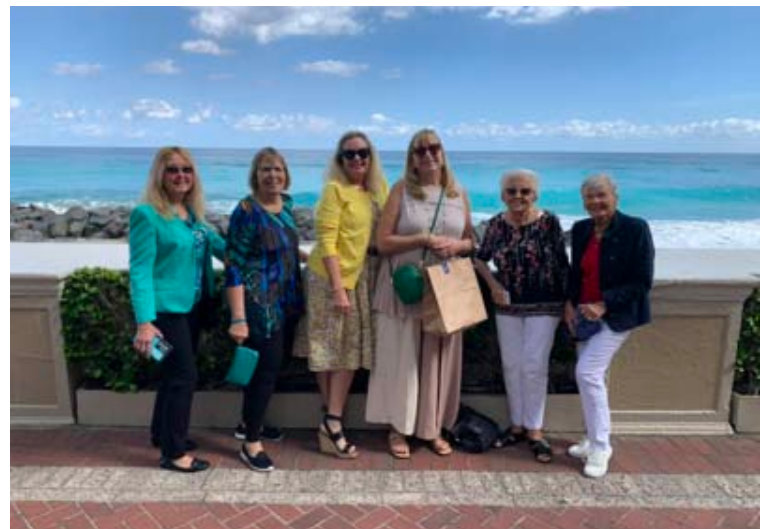
At the Breakers