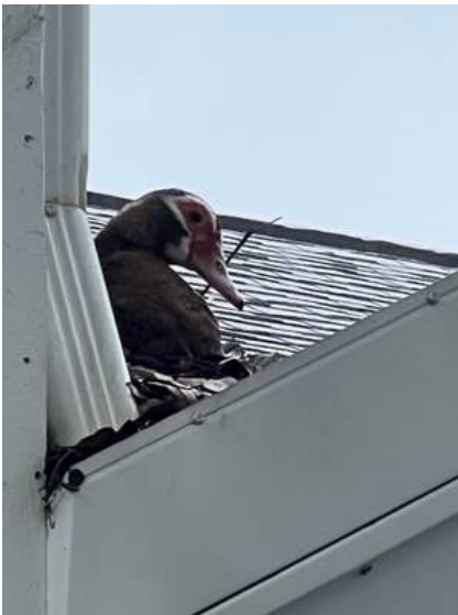
Maggie the Muscovy