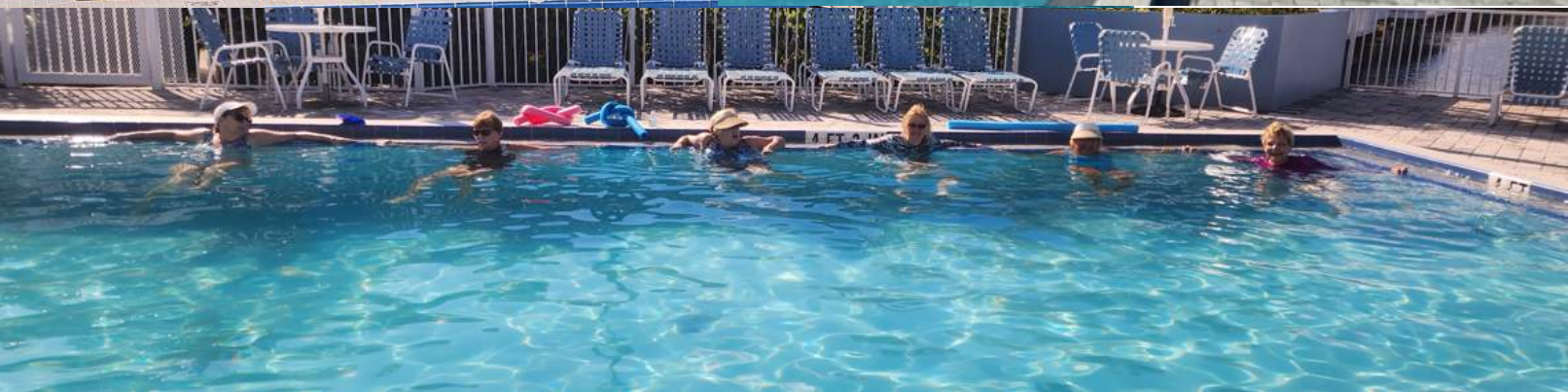
Fun in the pool