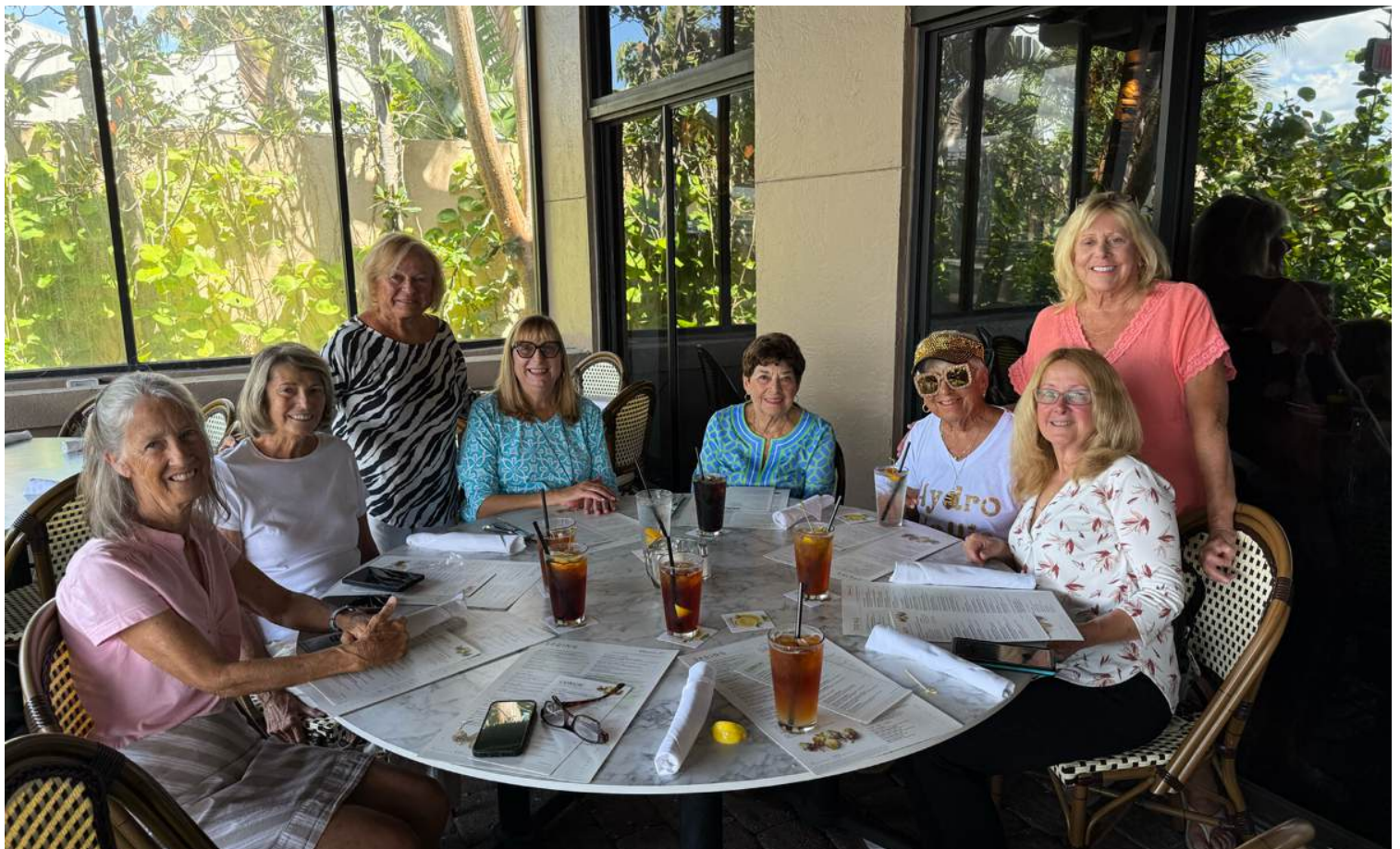
Thank You Luncheon